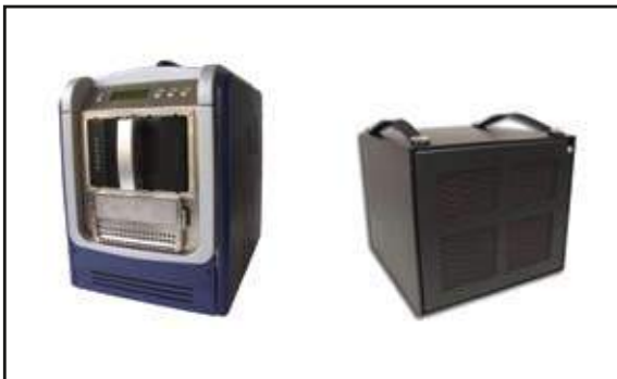
The Solid State Disk Readout Station (left) and the Flight Data Storage Copy Station (right) each offer the perfect solution for field data copy of raw DMC data.

The DMC system includes a complete post-processing system for converting the raw DMC exposures into standard central-perspective images. The system includes an optional rack-mounted server, high-performance RAID for data storage, and a multi-processor server for rapid, post-processing performance. Processed images, along with flight metadata, are stored in standard, non-proprietary formats for immediate