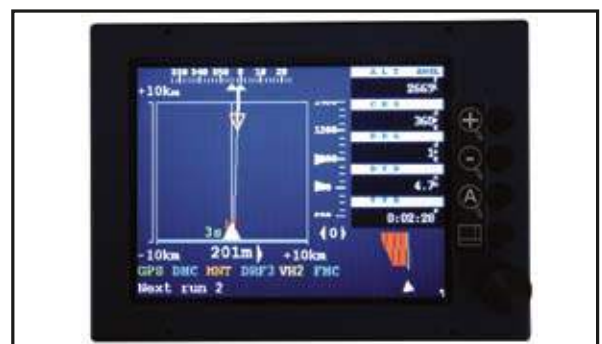
Intergraph's pilot display interface gives you easy readability.

When operated in full-color, 12-bit per pixel mode, the camera system generates about 272 megabytes of raw image data per exposure. Therefore, the control electronics require a special high-throughput design, which is capable of managing this data stream. It consists of two complete PCI-bus-based slot PCs operating in parallel. The image data of the camera modules is transferred via a parallel bus to high-speed, frame-grabber PCI-bus cards. Finally, the data is transferred via a separate data link from each of the CPU systems onto a removable, ruggedized storage system. This solid state disk system is a removable, solid-state RAM storage cartridge with